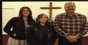
The Lail Family